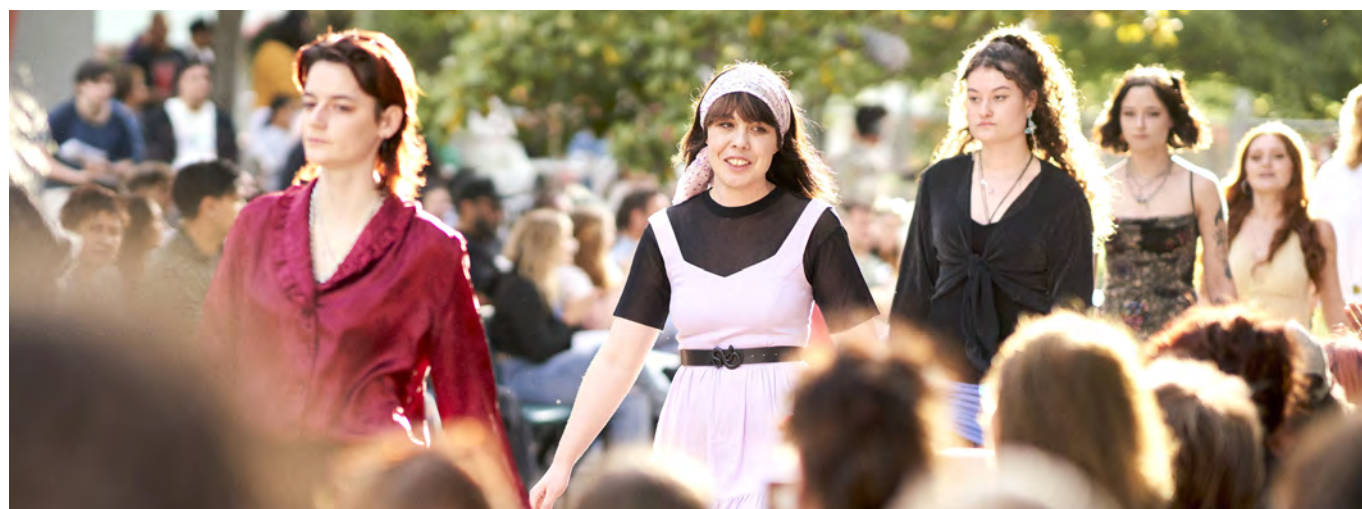
NZ Diploma in Fashion Level 5 2023 Fashion Showcase

They'll know your name and you'll receive one-on-one attention to make sure you get the support to succeed.