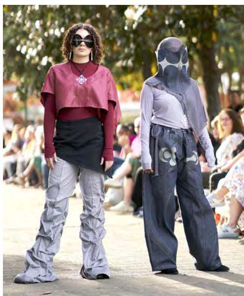
Designer: Jayden Spendiff Unity Unveiled collection

Check out what you qualify for at studylink.govt.nz .