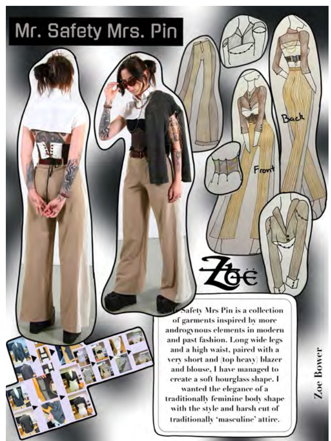
Designer: Zoe Bower recycled garment working drawings

Adobe Photoshop and Illustrator software is taught in computer labs.