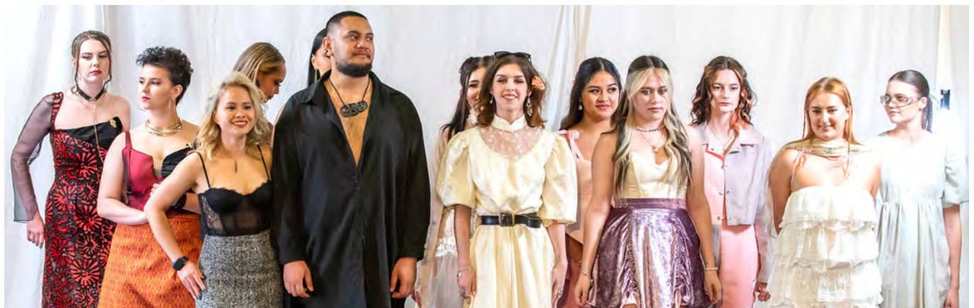
NZ Diploma in Fashion Level 5 learners (front row) with their models at the 2022 Fashion Showcase

They'll know your name and you'll receive one-on-one attention to make sure you get the support to succeed.